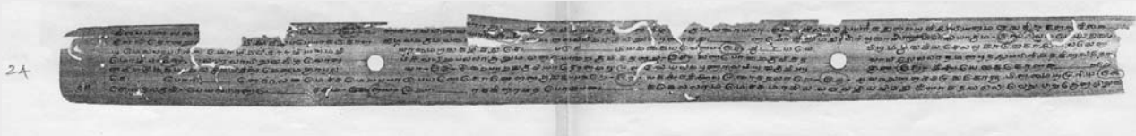
Iraiyāṅār Akapporuḷ et al., MSSML, Tañcāvūr