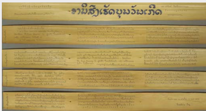
Palm leaf Manuscript "Anisong het bun van koet", dated Saturday, tenth waning day, twelfth lunar month, B.E. 2531. This date corresponds to 3 December 1988 of the Gregorian Calendar.

The main corpus comprises 287 manuscripts from Luang Prabang, the ancient royal capital of Laos where the social practice of anisong is still alive. This corpus, which for a greater part includes paratextual elements on their colophons (date, name of the scribe, donor's intention or wishes, etc.), will be compared with a microfilmed collection of almost 300 manuscripts from northern Thailand containing anisong texts and with another collection of more than 40 Tai Lü manuscripts from northern Laos and the Chinese province of Yunnan.