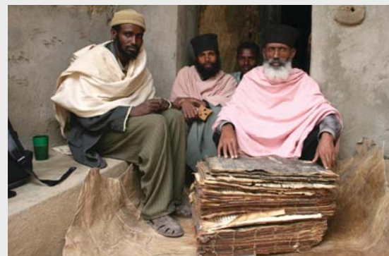
Yohannes Käma, Tagray, Northern Ethiopia, Ethiopic composite parchment manuscript, uncatalogued, fifteenth/sixteenth century; hagiographic collection

Rooted in the premises of the Aksumite kingdom, the Ethiopian and Eritrean area offers a peculiar case study of a manuscript culture in ancient, medieval and modern times. Historically a region of written civilization starting from the first millennium BCE, it bears witness to the relatively early introduction of parchment roll and codex, the latter favoured by the adoption of Christianity in the fourth century CE. Manuscript production has enjoyed a steady for-tune for centuries till the present time, when the practice is attracting an increasing number of scholars interested in marginal less known areas potentially preserving archaic or peculiar features. A constitutive part of its cultural and material tradition for centuries, the production of hagiographic manuscripts is universally acknowledged as a central and marking feature of Ethiopian manuscript culture.