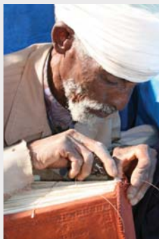
Craftsman sewing the end-binding of a liturgical manuscript in the town of Aksum, Tagray, Northern Ethiopia

The project aims to study the specific manuscriptological features of a new creation of intrinsic revolutionary character: extremely sporadic until the fourteenth century, more substantially from the fifteenth century on, Ethiopian prominent figures who had promoted monastic practice and intellectual debates, were recognized as saints and became in their turn characters of narratives fixed in manuscripts for devotional use. So far investigated in its historical and literary aspects only, the making of hagiographic manuscripts promises to disclose unexplored aspects of the Ethiopian manuscript culture: how and why Ethiopian hagiographic manuscripts were first produced; which was the labour division; which the ritual and liturgical accommodation of the manuscripts; which hagiographies went with which; how local saints were assimilated with foreign saints; how manuscripts contributed to shape and organize hagiographic cycles; which the role of archaic multiple-text manuscripts ('homilies') in prompting the creation of new models of manuscript; which are the parallels to this practice in other related and unrelated manuscript cultures.