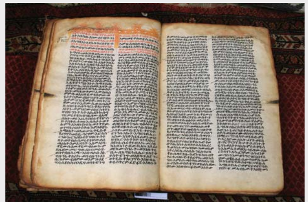
Däbrä Mädhanit, Tagray, Northern Ethiopia, uncatalogued, fourteenth/early fifteenth century, hagiographic collection: Ethiopic version of the Acts of Cyprian and Justina , with indication of liturgical reading on the margin

by the material, iconic, ideal, and performative presence of hagiographic manuscripts and 'parchment saints' throughout the time frame from Late Antiquity to the fourteenth century CE — time limit of the attestation of Ethiopian hagiographical manuscripts — to the present.